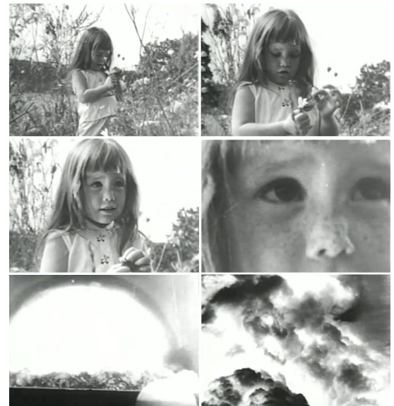
President Johnson's voiceover: "We must either love each other or we must die!"

On the other hand, negative campaigning focuses on making the competition look bad by attempting to ruin their public image. A specific example of this type of campaigning is the infamous Daisy Girl commercial (shots provided) that was created with intent to persuade viewers to harbor distaste for Johnson's opposition, Barry Goldwater. More often than not, these types of campaigns purposefully leave information out, or even twist the truth, in order to persuade the audience to think a particular way about the opposition.